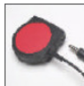
PTT Com Control Unit C-C400