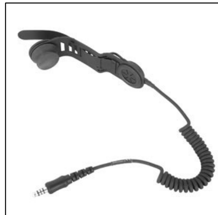
HC-1 Helmet – com unit

The new SAVOX® HC-1 is a compact and light weight helmet-com unit for professionals working in extreme and hazardous conditions. The SAVOX® HC-1 provides instant, clear and reliable "hands-free" communication, increasing personal safety and work efficiency, allowing full concentration on the actual task. Thanks to the unique arm/strap fastening system the SAVOX® HC-1 easily mounts in almost any type of helmet without any tools. The convenient bone conduction microphone is voice sensitive and makes a perfect combination with a breathing mask. The SAVOX® HC-1 connects to most SAVOX® com-control/PTT units adapting to most types of two-way radios.