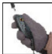
PTT Com Control Unit C-C500 with Microphone & Speaker

Weight 85g Size 40 x 160 mm Microphone vibration sensitive, impedance approx. 3500 ohm @1 kHz, noise cancellation 30 dB Speaker impedance 32 ohm Cable coiled (flame retardant): Ø 4mm/380mm, straight (flashover proof): Ø 4mm/750mm Connector 4-pole quick release plug Operation temperature -25...+63 °C (continuous) Supply voltage 3,0...10,0 VDC Humidity 95%RH, +63 °C for 500 hours ESD, EMI immunity confirms with the EN 301 489-1 Intrinsic safety *ATEX (EX) Approved Options SAVOX® HC-1 coiled cable/short headband SAVOX® HC-1 coiled cable/long headband* SAVOX® HC-1FP straight cable/long headband*